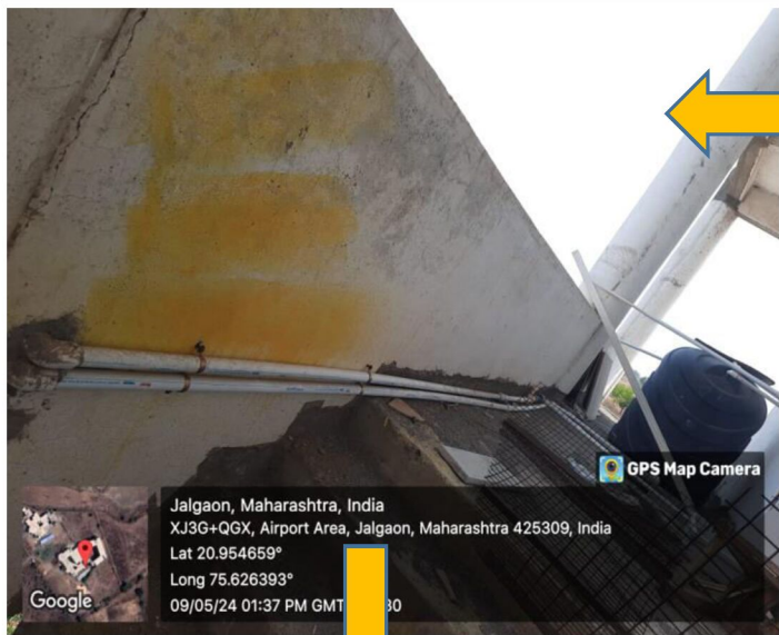
Jalgaon, Maharashtra, India XJ3G+QGX, Airport Area, Jalgaon, Maharashtra 425309, India Lat 20.954659° Long 75.626393° 09/05/24 01:37 PM GMT +05:30