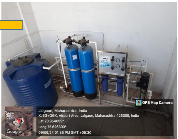
Jalgaon, Maharashtra, India XJ3G+QGX, Airport Area, Jalgaon, Maharashtra 425309, India Lat 20.954659° Long 75.626393° 09/05/24 01:36 PM GMT +05:30