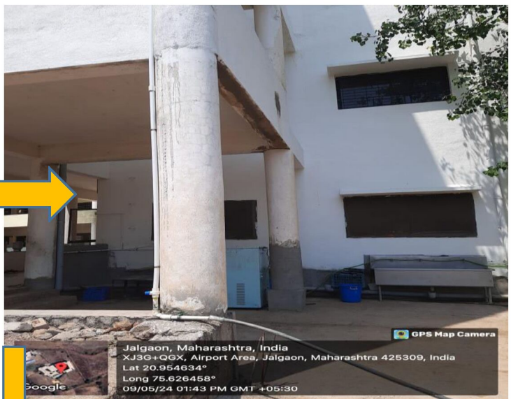
Jalgaon, Maharashtra, India XJ3G+QGX, Airport Area, Jalgaon, Maharashtra 425309, India Lat 20.954634° Long 75.626458° 09/05/24 01:43 PM GMT +05:30