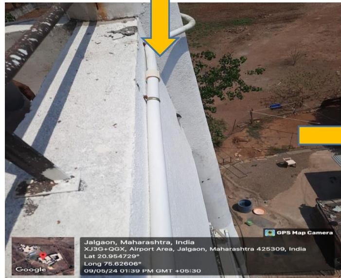
Jalgaon, Maharashtra, India XJ3G+QGX, Airport Area, Jalgaon, Maharashtra 425309, India Lat 20.954729° Long 75.62606° 09/05/24 01:39 PM GMT +05:30