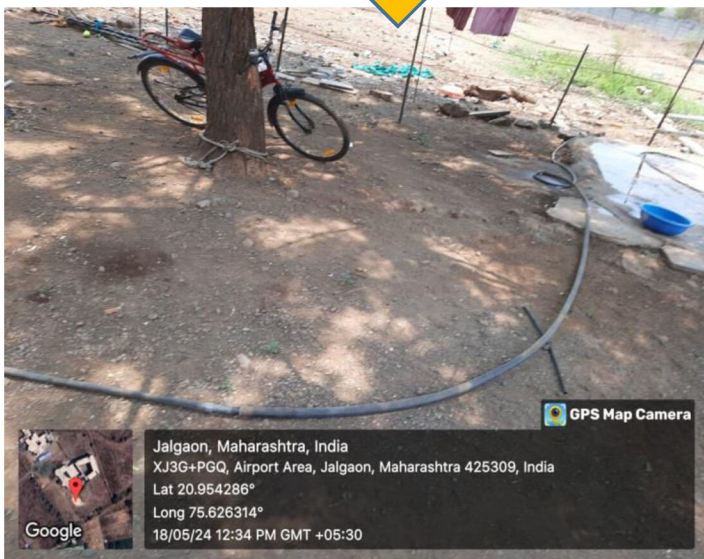
Jalgaon, Maharashtra, India XJ3G+PGQ, Airport Area, Jalgaon, Maharashtra 425309, India Lat 20.954288° Long 75.626314° 18/05/24 12:34 PM GMT +05:30